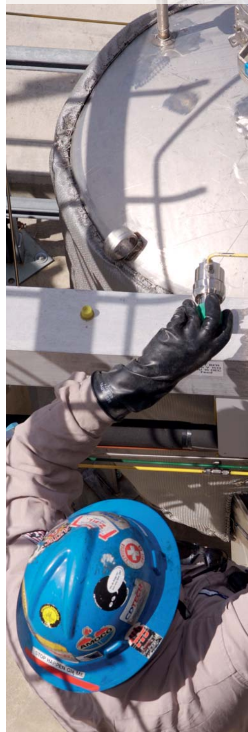
One of the process development facilities at the Shell/CR&L laboratories in Houston.