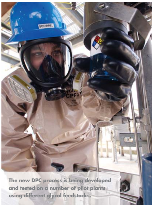
The new DPC process is being developed and tested on a number of pilot plants using different glycol feedstocks.