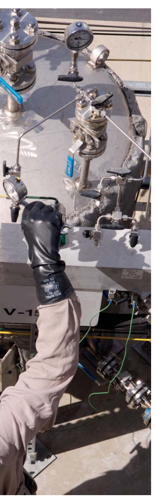
Phosgene-free DPC has the potential to become a significant intermediate for the polycarbonates value chain.